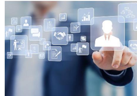
Supply chain operations through a customer first lens

Harness intelligent forecasting & planning data models to drive elevated product availability whilst using intelligent automation to action stock management and allocation; have product in the right place and at the right time to meet demand.