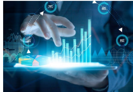
Forecasting, planning & stock optimisation

Meet the demands of your customers through, supplier and product ranging activities that align to financial planning, budget allocation and market conditions.