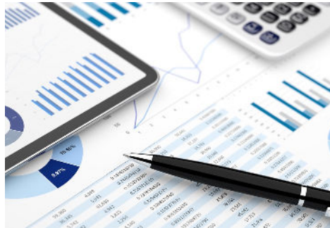
Financial and product management

Meet the demands of your customers through, supplier and product ranging activities that align to financial planning, budget allocation and market conditions.